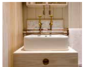
Rupert's style is showcased in this self-catering, off-the-grid retreat, which features solar lighting, a wood-burning stove and gas hob, and exposed wooden beams